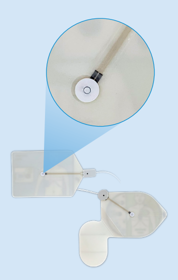
Pad sensors detect contact with the manikin, eliminating the need for a separate remote

ZOLL Medical Corporation Worldwide Headquarters 269 Mill Road Chelmsford, MA 01824 978-421-9655